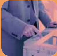
Users enter enterprise authentication credentials at the device.