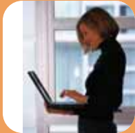
Files are sent from any workstation.