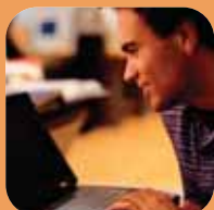
Files are sent from any PC or wireless device.