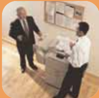
The document is released to print.