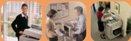
Users release the job from the most convenient, compatible device.